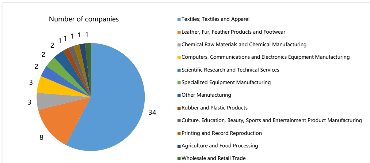
Figure 2 Distribution of enterprises by industry